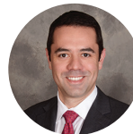
Chief Investment Officer, Global Financial Private Capital