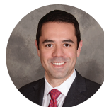
Chief Investment Officer, Global Financial Private Capital

This material is for informational purposes only and sets forth the views and opinions of our investment managers as of this date. The comments, opinions and estimates are based on or derived from publicly available information from sources that we believe to be reliable. This commentary is not intended as investment advice or an investment recommendation nor should it be construed as a solicitation to buy or sell securities. Past performance is no indication of future performance.